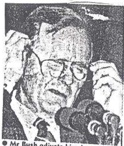
● Mr Bush adjusts his glasses after crying as he recalled the Gulf War.